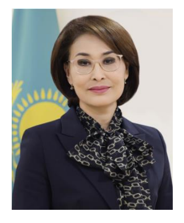
Dr Akmaral Alnazarova Minister of Health of Kazakhstan